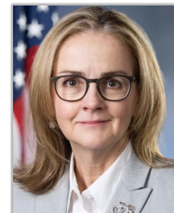
Hon. Madeleine Dean Pennsylvania's 4 th Congressional District United States Representative

7:00-8:00am Open 12-Step Meeting in Governor's Square 15